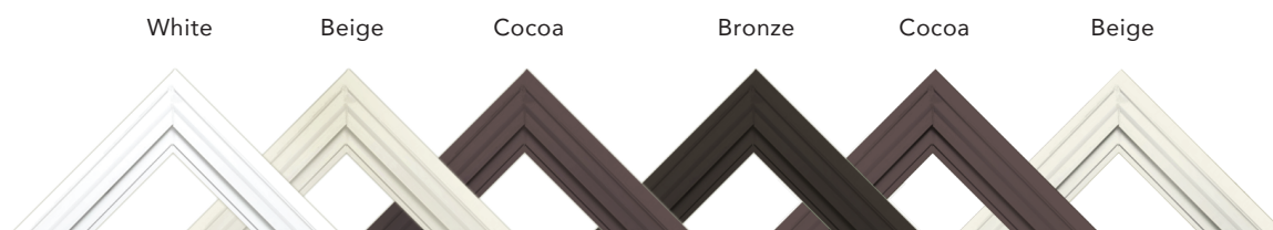
Stock Vinyl Extrusions

3 Other grid options available; ask your salesperson for details