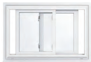
2-Lite Slider 3-Lite Slider